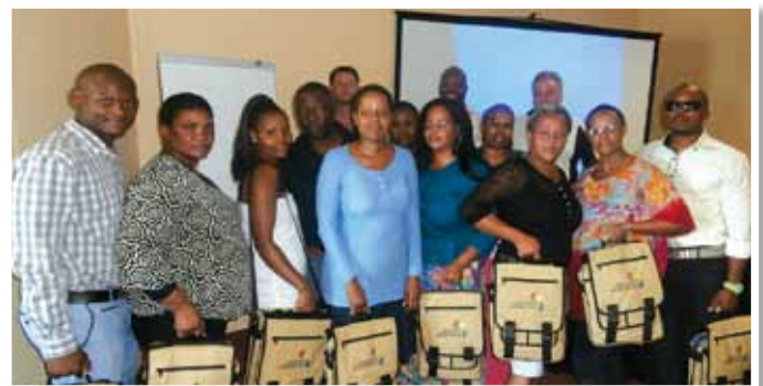
SIC Learners- East London